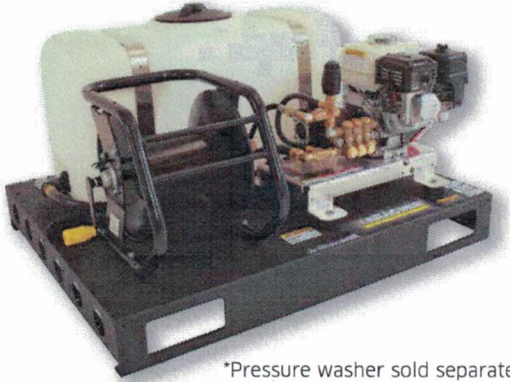
*Pressure washer sold separate.